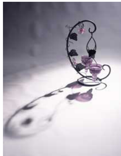
Illustration 5. 210mm Super-Symmar at f/5.6

The point of focus is the rear part of the forward candleholder. Compare the soft way the PS945 renders the out of focus objects, such as the rear candleholder. Also the two lenses render the dimples in the background paper differently, where the PS945 is clearly softer. To get a closer look at how these two lenses produce their images, compare the two enlargements in Illustrations 6 and 7. These differences are most obvious in the specular highlights,