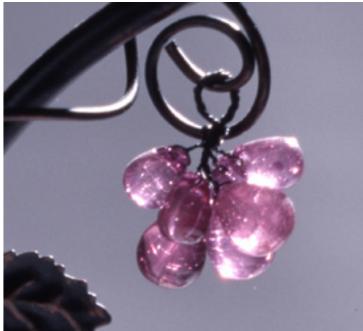
Illustration 7. 210mm Super-Symmar at f/5.6, detail

These details point out another aspect about the soft-focus imaging of the PS945. The soft-focus halting is most noticeable when it spreads onto an adjacent darker area. In other words, one can expect to achieve more of a soft-focus feel where there are distinct contrasts, light against dark. Harder lighting, for instance from spots, produces more of a soft-focus effect than the soft, even lighting of a softbox. Backlighting, which in most cases means there are some extreme contrasts between blown-out highlights and shaded parts of the subject, is useful to emphasize