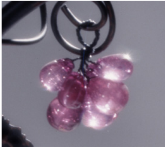
Illustration 6. PS945 at f/5.6, detail

but one can also see how the PS945 spreads highlights into darker areas.