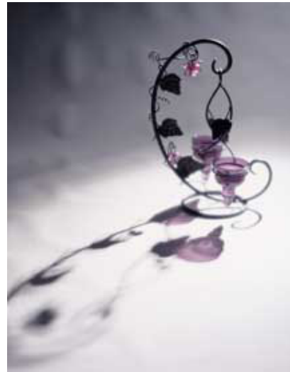
Illustration 4. PS945 at f/5.6

and the patience, to be completely accurate, here the f/stop was simply kept constant at f/5.6.