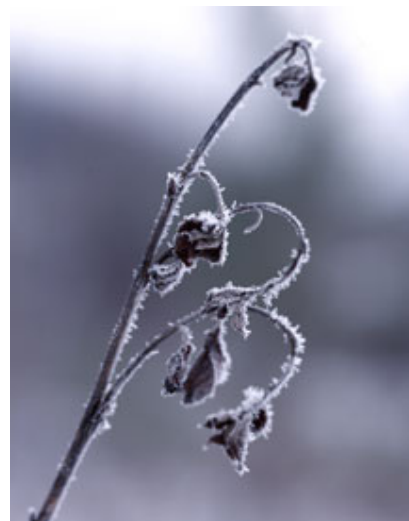
Illustration 2. f/4.5

At f/16 the tiny ice crystals fringing the plant remnant are tack sharp. Behind the plant were barren bushes with twigs randomly sprayed in all directions. In the picture, the background looks like brushstrokes, with out of focus highlights that were rendered as roundish blobs. At