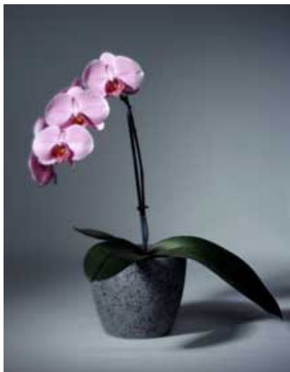
Illustration 13. PS945 at f/4.5, back tilt/swing