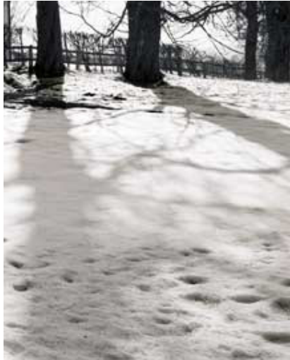
Illustration 9. PS945 at f/4.5, back tilt

Illustration 9 was taken at f/4.5, with a little back tilt to retain some focus across the picture. The sun was just beyond the top edge of the picture, yet there was no significant flaring and no internal reflections. The barbed wire in illustration 10, which again was taken at f/4.5 with some back tilt, is relatively sharp.