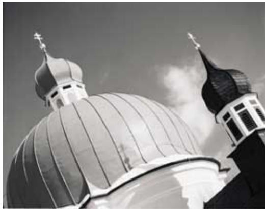
Illustration 12. PS945 at f/4.5, back swing

Juxtaposing a thought from Cézanne against the quote above from Coburn: "Knowledge of the means to express our emotion is essential – and is acquired only after very long experience." One way to either shorten the path or broaden the scope of acquiring experience is for those in a community of practice to share their knowledge with others. Perhaps the thoughts shared in this paper may be helpful to some; or if they are meaningless, at least they can point out the creative cul-de-sacs.