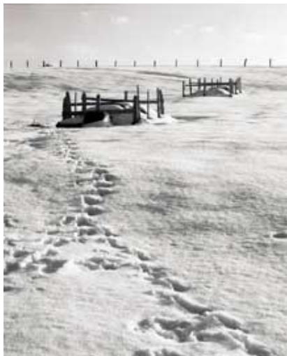
Illustration 10. PS945 at f/4.5, back tilt

In order to use wide apertures in bright conditions, just use an 8x neutral density filter. Under "sunny 16" with EI 100 film,