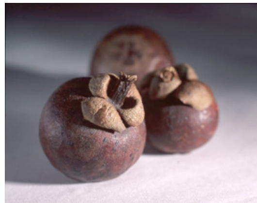
Illustration 8. PS945 at f/11, 1:1

The way the PS945 treats backgrounds is especially useful in macro-photography. The 1:1 magnification picture of mangostin fruits (Illustration 8) taken at f/11 has very tactile detail in the forward object. The focus very gently tapers off toward the background.