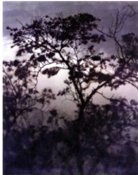
Illustration 11. Reflection. PS945 at f/4.5, scan of Polaroid print

If you have interest in helping to build such a community, send an email to one of the contacts listed below.