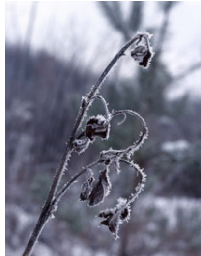
Illustration 1. f/16

The first couple of pictures show how soft-focus varies with f/stop. Illustrations 1 and 2 were taken deliberately against a cluttered background, in part to get a feel about the “bokeh” of the lens.